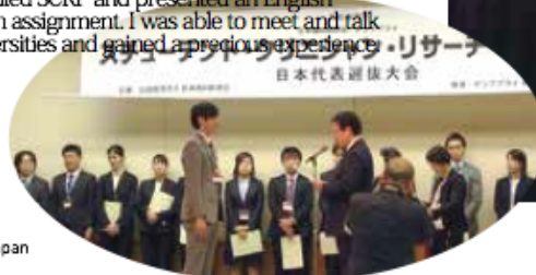
Awards ceremony at SCRP Japan Representative Tournament