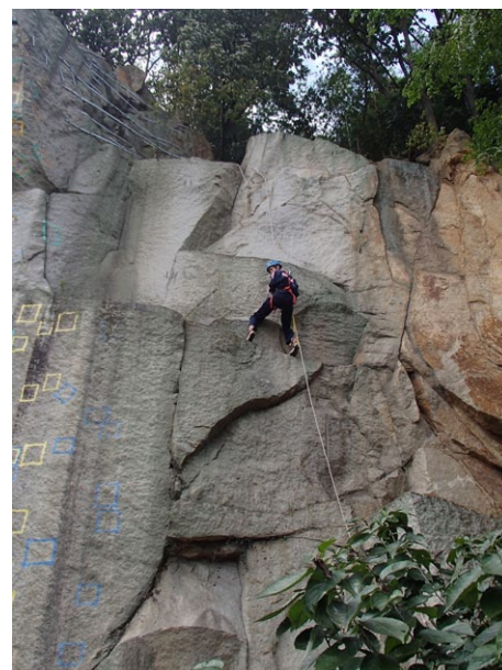
Practicing going into a cave hole with a single piece of rope