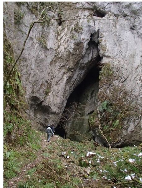
Entrance to a cave with an entrance of 30 meters

“We also gather to enjoy barbeques and events not directly related to caving,” says Takami. “Come and join us!”