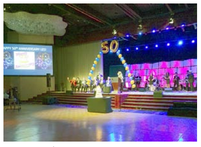
The LES 50<sup>th</sup> Anniversary Ceremony