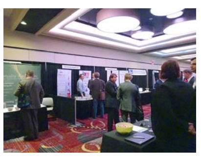
The Tech Fair