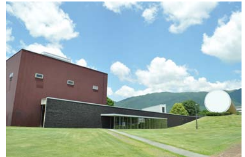
Exterior of the main buildings.

Website http://www.town.nagi.okayama.jp/moca/index.html