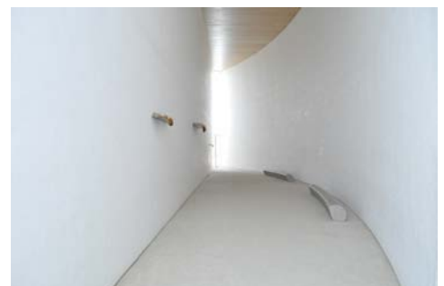
Exhibition room "Moon". Kazuo Okazaki