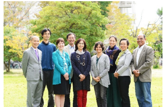
The staff of the Discovery Program

Okayama University looks forward to welcoming young and motivated students on a new and exciting journey of multidisciplinary Discovery!