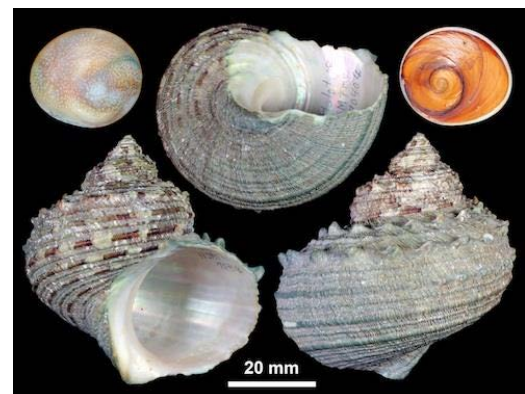
Fig. 2. Turbo cornutus from China.