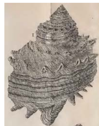
Fig. 3. The original illustration of the type specimen of Turbo cornutus from China, after Davila (1767).