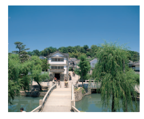
Iconic Kurashiki with a monochrome warehouse, weeping willows, and a stone bridge.