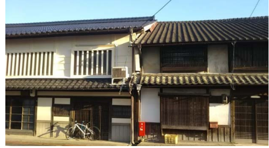
Historic Housing in Tsuyama City

With this background, Okayama University agreed to cooperate with 10 regional municipalities to support their activities in regenerating local communities.