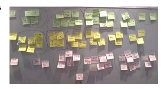
Results of a workshop with local stakeholders.

On the same day faculty members from OU met representatives from local authorities and businesses who shared their visions for the future of the local communities. The local communities proposed that OU conduct research on local problems, have exchanges with local communities, and give advice on local initiatives. In the discussions several issues were raised, including in the area of SDGs goals 3 (health and well-being), 4 (education), and 8 (economic growth).