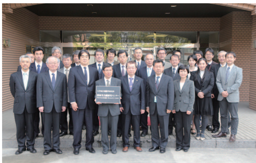
Members of the Center participating in at the inauguration ceremony.