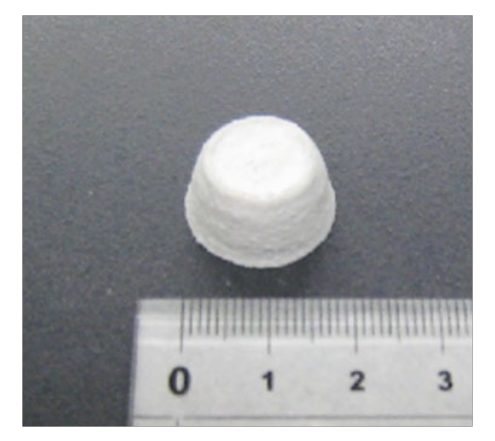
Fig.1. Photograph of as-prepared ZSM-5 bulk bodies.

The resulting ZSM-5 bulk bodies have macropores with about 8 µm in diameter, and their apparent density and porosity were estimated to be about 1.5 g/cm<sup>3</sup> and 45 %, respectively. It is important to evaluate the mechanical properties of the ZSM-5 bulk bodes if they are to be utilized as porous bulk materials. The bulk bodies of ZSM-5were trimmed to form pellets with a diameter of 12 mm and a thickness of 5 mm. The pellets were subjected to a drilling test using a 5-mm-diameter twist drill. A doughnut-shaped pellet was non-destructively processed, as shown in Fig. 2. The bending strength of the ZSM-5 bulk bodies was about 5 MPa.