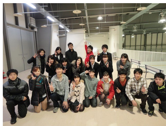
At an inter-collegiate competition