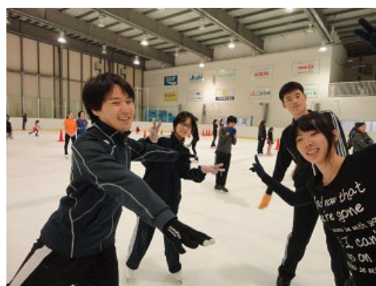
Practicing at the Okayama International Ice Rink