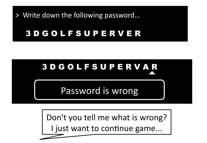
Figure 2: Detecting wrong password