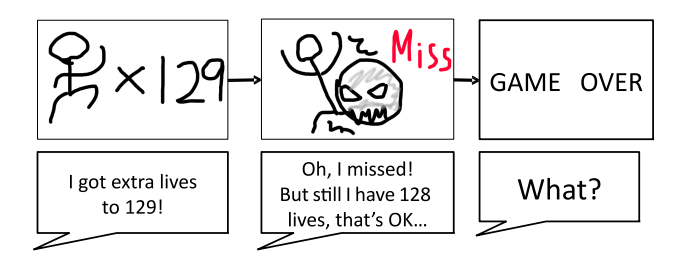
Figure 1: 1-up glitch

Copyright is held by the owner/author(s). WiPSCE '14, Nov 05–07 2014, Berlin, Germany ACM 978-1-4503-3250-7/14/11. http://dx.doi.org/10.1145/2670757.2670770