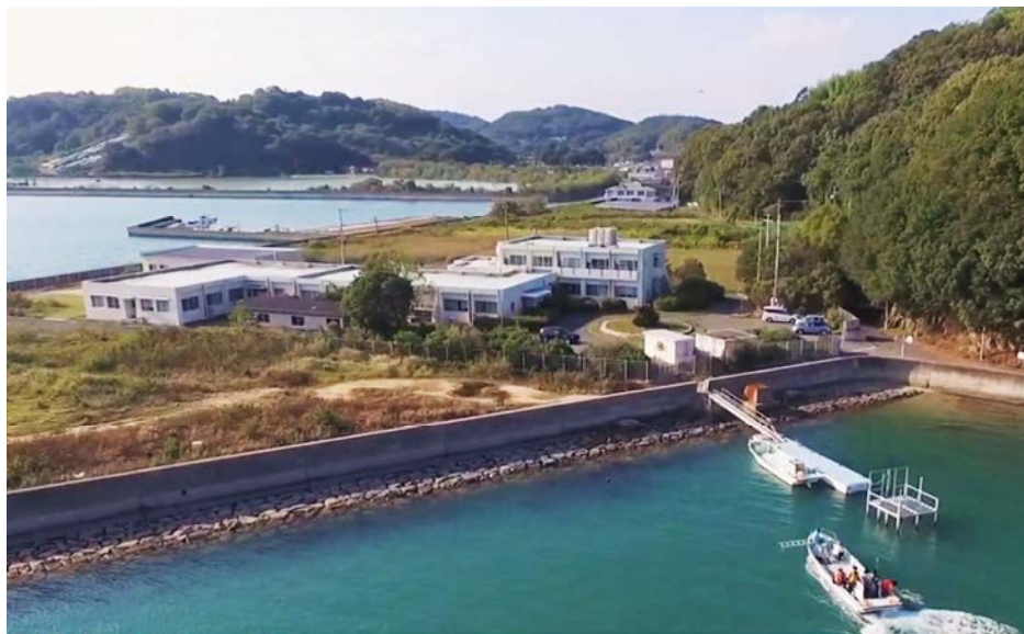
Okayama University Ushimado Marine Institute (UMI) https://www.science.okayama-u.ac.jp/~rinkai/en/index.html