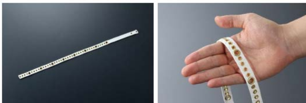
Medical supportive device for hemodialysis catheter puncture

Then the exit section is set and the catheter is guided in a direction from the outlet to the neck, and the inner cylinder of the dilator is removed. The catheter is inserted into the dilator and the process is completed when the dilator sheath is split and removed. This process enables the accurate and reproducible placement of catheters without deviation.