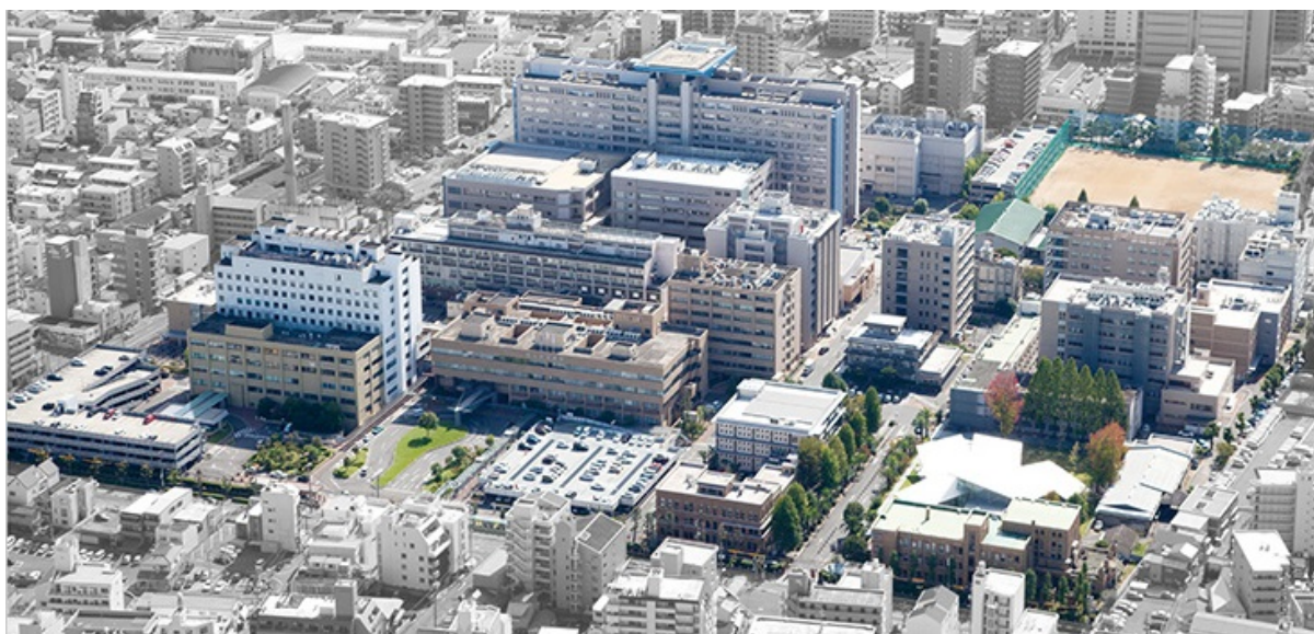
Okayama University (Shikata Campus, Okayama City)

http://www.okayama-u.ac.jp/eng/access_maps/Tsushima_Campus.html