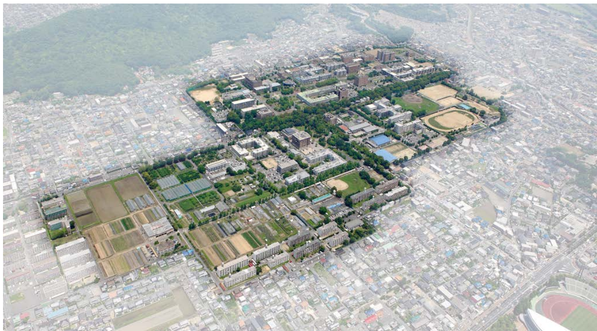
Okayama University (Tsushima Campus, Okayama City)

Vol.45 : Link between biological-clock disturbance and brain dysfunction uncovered