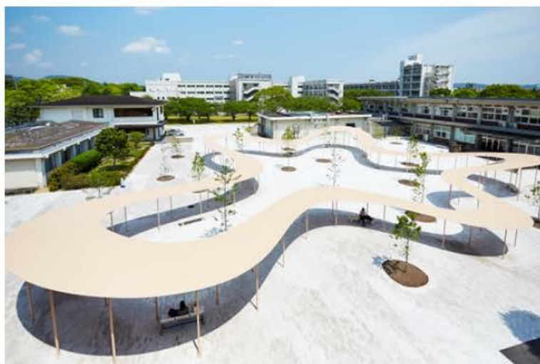
「Pergola」 Kazuyo Sejima + Ryue Nishizawa / SANAA Okayama University (Tsushima Campus, Okayama City)

Okayama University supports the Sustainable Development Goals