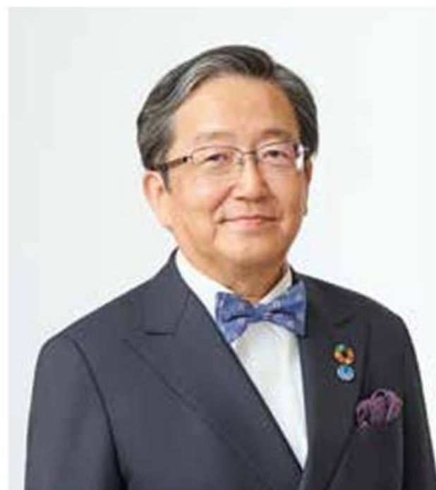
国立大学法人岡山大学 第15代学長(第5代法人の長) 那須 保友