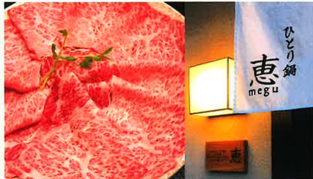
Table charge-free Muslim-friendly

Menu (in Eng.) Halal dishes Vegetarian dishes