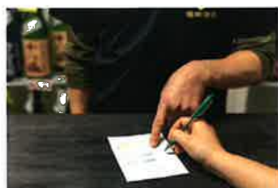
Staff teach me how to order.

Surprisingly, it is said that there is an Izakaya in Ekimaechō, which embodies the atmosphere of the original ones that date back to the Edo Period. An editor, who was on a business trip, entered the place, and later wrote.