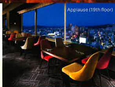
Applause (19th floor)

■1-5 Ekimotomachi, Kita-ku, Okayama-shi ■086-233-3138 ■Credit card accepted