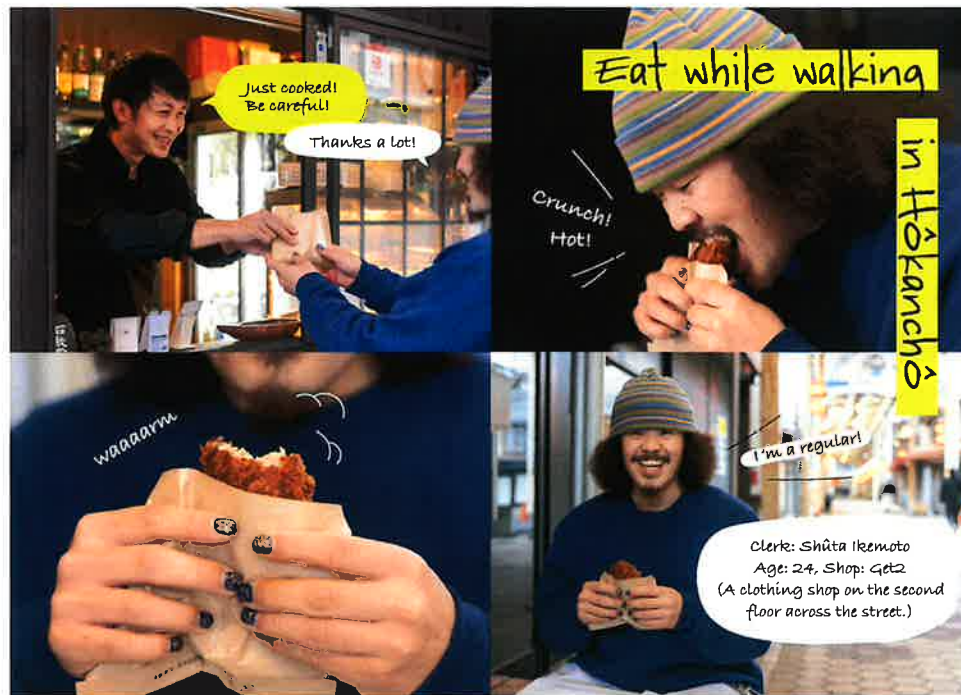
*Mincemeat cutlets to-go are only available during business hours. Buy some before they're sold out.

This is a Teppanyaki (iron-plate-cooking) Izakaya where you can enjoy Tsuyama's soul food, " Hormon Udon ," which is one of the most popular "B-grade" cuisines (cheap but tasty food) as well as Kaki-Oko (oyster okonomiyaki ). We also serve Hiroshima-style okonomiyaki and Teppanyaki as well as variety of side dishes which go well with sake.