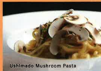
Ushimado Mushroom Pasta

This is an eatery with counter seats, serving fluffy and chewy brown (unpolished) rice from Okayama cooked in a pressure cooker. Okayama Curry made with seasonal local vegetables and peach chutney is a special dish. Our dishes only use fish, and no meat is served here or used in cooking.