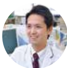
Director, Department of Dermatology