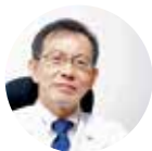
Director, Department of Pediatrics,