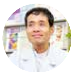
Director, Department of Otorhinolaryngology