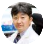
Director, Cardiovascular Surgery Department