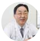
Director, Ophthalmology Department