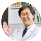
Director, Breast and Endocrine Surgery Department