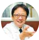
Director, Department of Orthopaedic Surgery