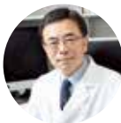
Director, Gastroenterology and Hepatology Department