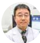
Director, Oral Diagnosis and Dentomaxillofacial Radiology