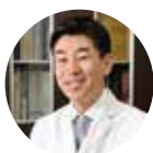
Director, Department of General Thoracic Surgery