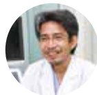
Director, Department of Pediatric Cardiology