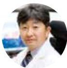
Director, Department of Pediatric Cardiovascular Surgery