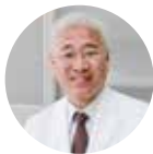
Director, Department of Anesthesiology and Resuscitology