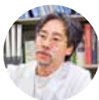
Director, Plastic Surgery Department