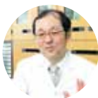
Director, Department of Gastroenterological Surgery