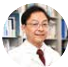
Director, Department of Urology