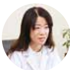
Director, Department of Pediatric Dentistry