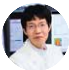
Director, Pediatric Radiology Department