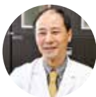
Director, Pediatric Surgery Department