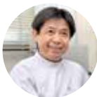
Director, Department of Preventive Dentistry