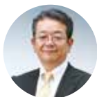
Director, Department of Hepato-Biliary-Pancreatic Surgery