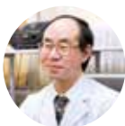
Director, Department of Infectious Diseases