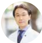
Director, Department of General Medicine