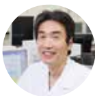
Director, Pediatric Anesthesiology Department