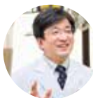
Director, Department of Oral and Maxillofacial Surgery (Biopathology)