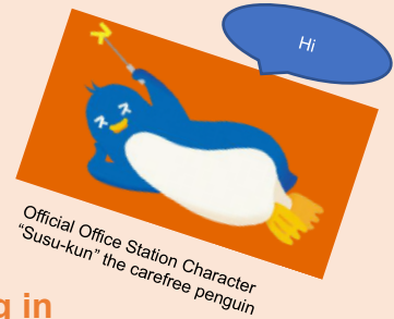
Official Office Station Character "Susu-kun" the carefree penguin

Access the following procedure manual (for those logging in for the first time)