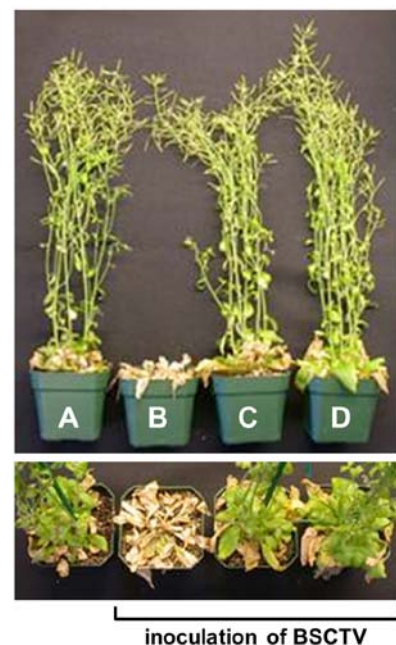
Figure 2: Creation of virus-resistant plants with AZP. Plant A is a healthy wild plant without virus infection. Inoculated BSCTV to plants B, C and D. Stem of the wild plant (Plant B) stopped growing and died 4 weeks after BSCTV inoculation. In contrast, AZP-transgenic plants (Plants C and D) showed complete virus resistance. In our AZP-transgenic plants with no symptoms, viral DNA was not detected at all by Southern blot analysis.