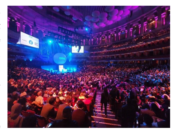
The photo of opening ceremony