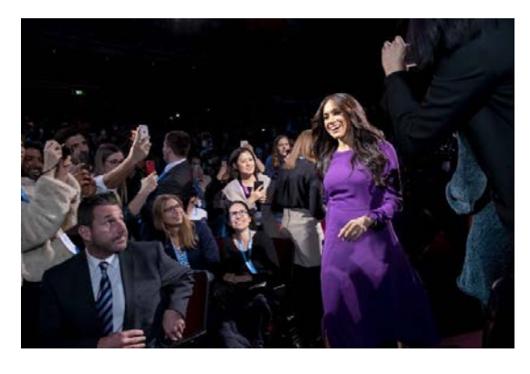
The entrance of Meghan, Duchess of Sussex (from OYW)