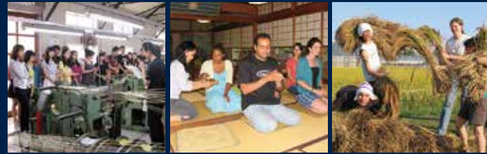
"Study of Japan" class

Japan's War and Peace, Study of Japan, Intercultural Communication, Family and Gender, A Guide to Modern Biology, Political Economy of Modern Japan, Frontiers of Natural Science, sports class, etc.