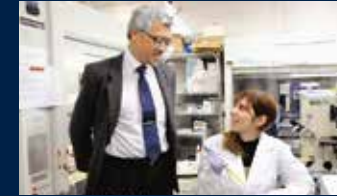
Meet your professor

Medical, Science, Engineering, Literature, Law, Economics, English Education