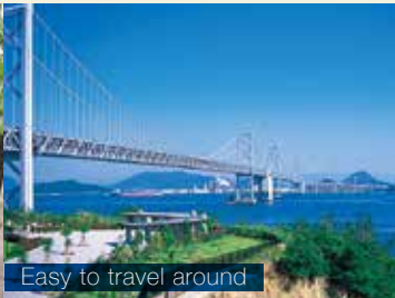
Easy to travel around