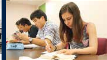
Study with Japanese students